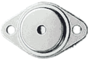
TO3 laser diode package

RLT650-200G, 650 nm , 200 mW, mm, 9 mm, with photodiode, datasheet