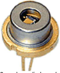
9 mm laser diode package

RLT635-100G, 635 nm , 100 mW, mm, 9 mm, datasheet