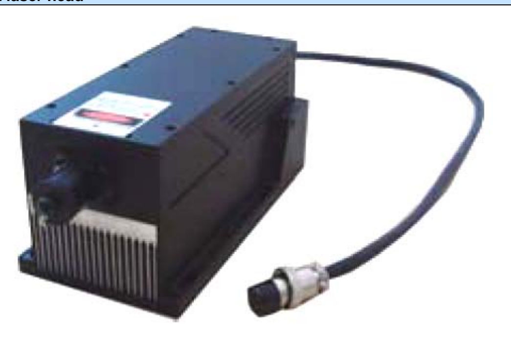
235 x 99 x 94 mm<sup>3</sup>, 2.6 kg