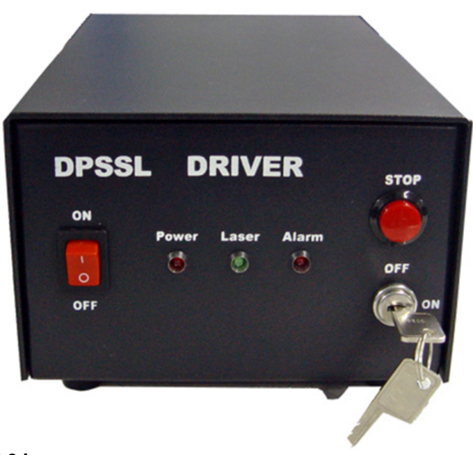
238 x 146 x 102 mm<sup>3</sup>, 2.3 kg